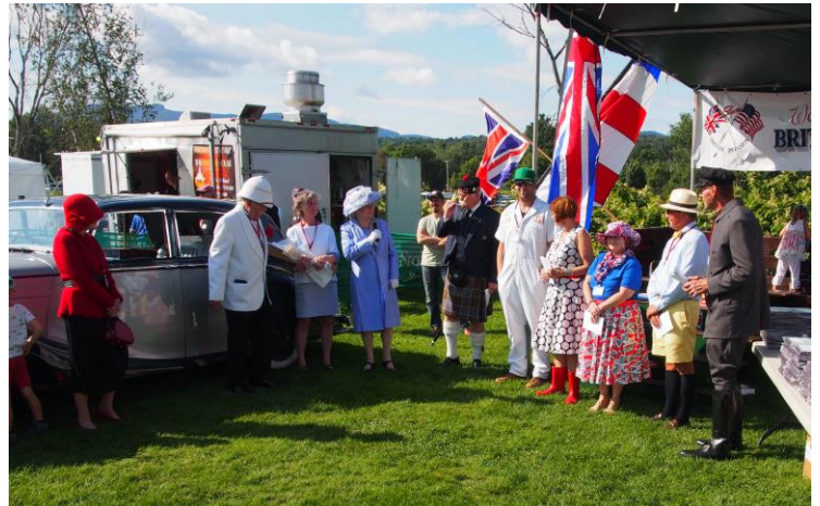
One of the Invasion's most light-hearted events--winners of the British Attire competition.

This year's British Attire competition included more than the usual number of participants. Cars on the field represented the makes of nearly every British auto manufacturer during the post-war era and several made prior to WWII. Even a Triumph-based Rat Rod attended. For many years, owners of Singer cars created a large display featuring their cars, which were made from 1905 to 1970. One year, they built