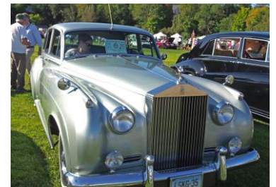
The Brainerd Family's 1959 Rolls-Royce Silver Cloud 1.

As has been the custom for several years, parking fees were collected to benefit the American Cancer Society.