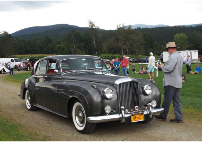
Another beautiful Bentley saloon being awarded on Sunday morning.

As they have for many years, a number of Yankee Region members attended this year's British Invasion in Stowe, VT, during the second weekend of September. They lined up their cars on the field and created a beautiful display of proper motorcars, attended as guests, entered the highly competitive Concours section, and/or served as Concours judges.