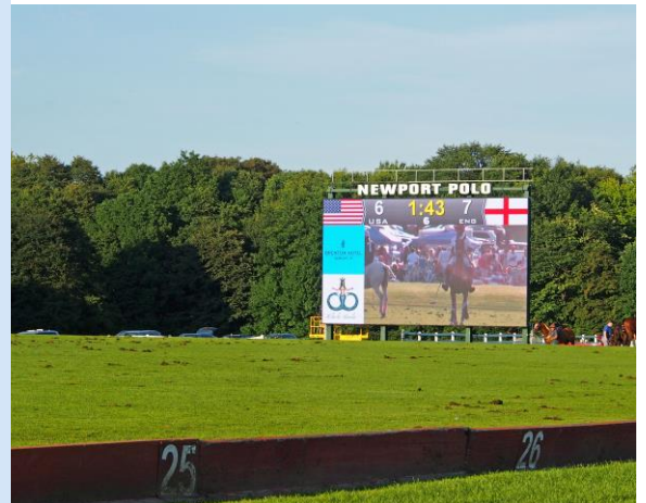
The final results of an exciting match.

A few examples of the beautiful automobiles that Yankee Region owners drove to the field.