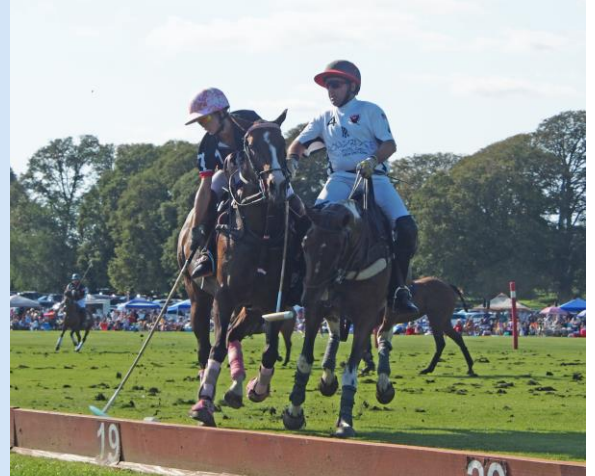
The action got close to our seats.

If you have never attended a match, try to join the Yankee Region next summer.